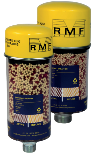
Titan Desiccant Breathers