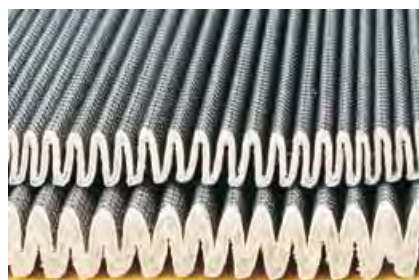
Photo above shows 'dry' Par-Gel filter media and the same media swollen with absorbed water.

The Par-Gel filter media is a highly absorbent copolymer laminate with an affinity for water. However, hydraulic or lubrication fluid passes freely through it and the water is bonded to the filter media.