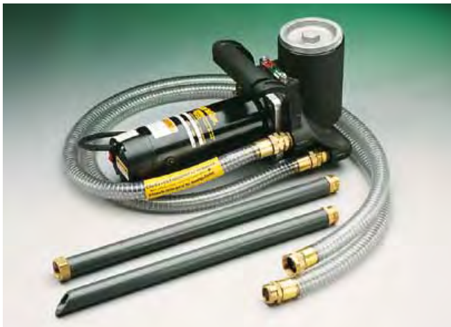
Guardian Portable Filtration System